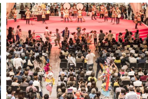
Folle Nuit (interactive concerts)