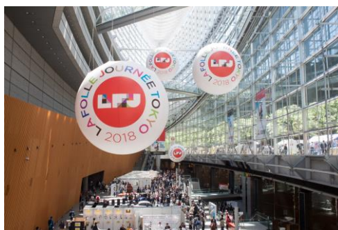
Tokyo International Forum Decoration