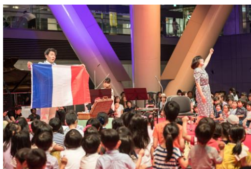
Children and Music (Workshops)