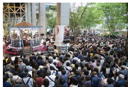
Free concert stage and Kiosk