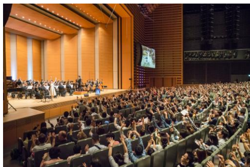
Hall A Concerts from 0 years old