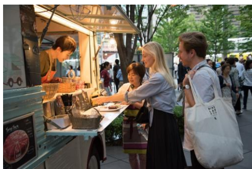
Various Food trucks