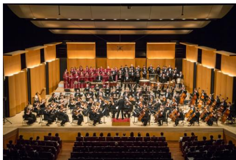
Hall C · Hall B7 etc. various paying concerts