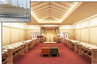
KANKO KIKAKU SEKKEISHA

The Okura Prestige Tower's wedding facilities will include the top-floor Sky Chapel for stunning views of Tokyo, the classically elegant Grand Chapel, and a hall for traditional Japanese Shinto weddings.