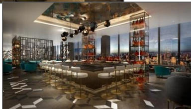
G.A. DESIGN INTERNATIONAL LIMITED

The Okura Prestige Tower's fifth-floor Orchid Bar will be a sophisticated, contemporary reinterpretation of the original Orchid Bar's tradition and prestige. On the top floor, Starlight guests will enjoy magnificent views of the Tokyo nightscape from three vantage points—The Bar, The Lounge and The Chef's Place.