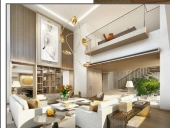
G.A. DESIGN INTERNATIONAL LIMITED

The spacious guest rooms in The Okura Heritage Wing will offer a generous floor area of 60m 2 with broad 8m widths. All rooms will feature the distinctive flavor of Japanese interior design and come equipped with steam saunas and spa baths for enhanced relaxation.