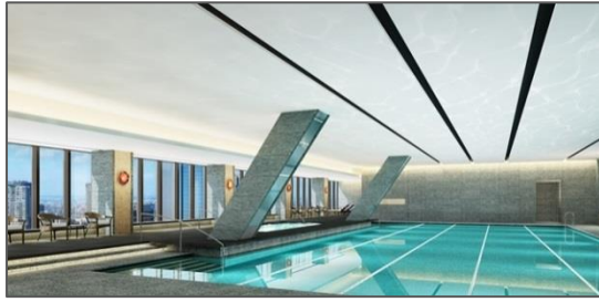
TAISEI DESIGN Planners Architects & Engineers

The Okura Prestige Tower will offer access to the Okura Fitness & Spa for exercise and relaxation against the backdrop of panoramic views of Tokyo on the 26 th and 27 th floors.