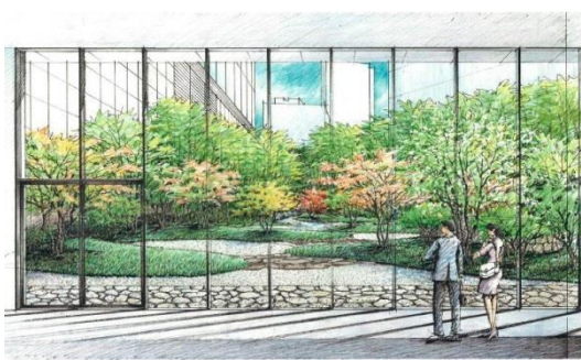
TAISEI DESIGN Planners Architects & Engineers

Covering approximately half (13,000 square meters) of The Okura Tokyo’s property, the Okura Garden will be an expansive “urban oasis” that captures the beauty of each season and incorporates the Japanese-garden karesansui tradition of using rocks and raked sand to express water themes.