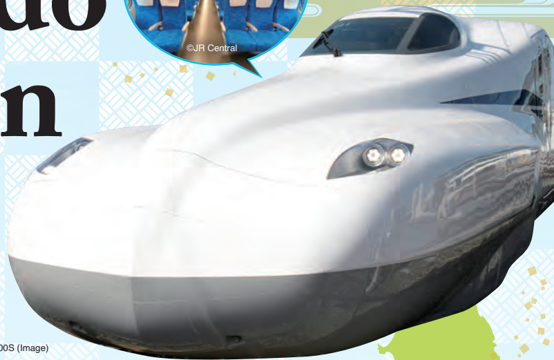
Shinkansen Series N700S (Image)