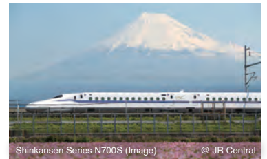
Shinkansen Series N700S (Image) © JR Central

Tokyo ⇄ Nagoya: about 2h40min Tokyo ⇄ Kyoto: about 3h40min Tokyo ⇄ Shin-Osaka: about 4h