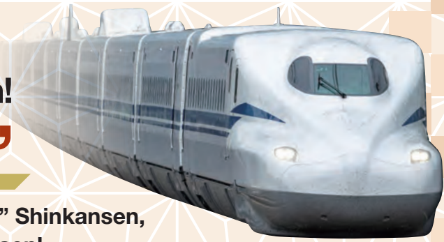
Shinkansen Series N700S (Image) © JR Central

is a simple one-way travel package using “Kodama” Shinkansen, set between major stations on the Tokaido Shinkansen!