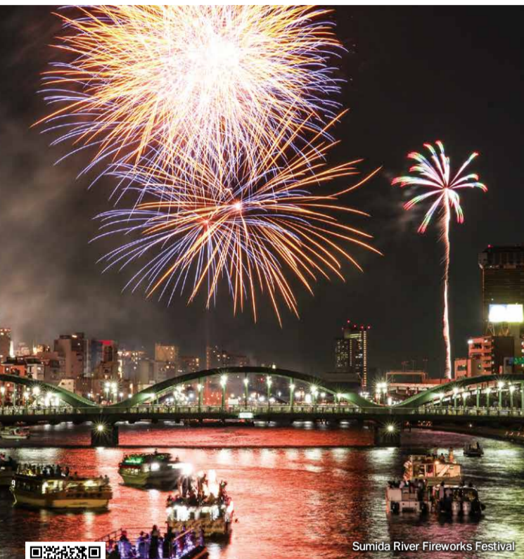
Sumida River Fireworks Festival ◀ We introduce the appeal of Taito City, especially for Muslims. Follow us on the Facebook!

The business status of each facilities may differ from the description. Be sure to confirm the details before visiting.