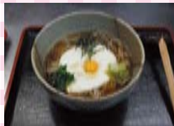
Tororo Soba (buckwheat noodles with grated yam)