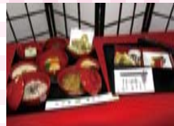
Shojin-ryori (Buddhist vegetarian cuisine)