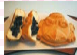
Tenguyaki (crispy pastry with black bean paste)

The information about restaurants and souvenir shops are on the map.