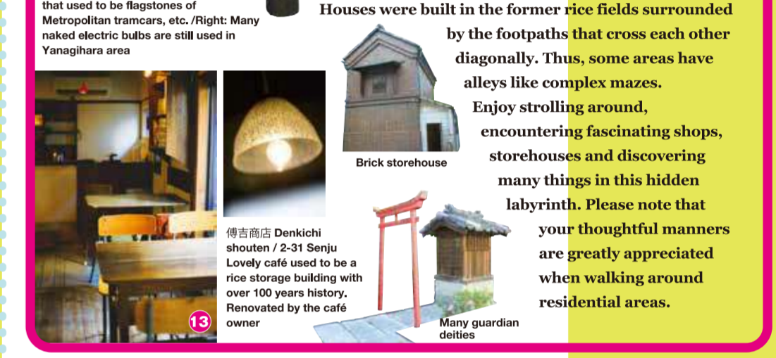
Above: Repurposed stone pavements that used to be flagstones of Metropolitan tramcars, etc. / Right: Many naked electric bulbs are still used in Yanagihara area Manhole from the Senjumachi era (1888-1932) Brick storehouse 傳吉商店 Denkichu shouten / 2-31 Senju Lovely café used to be a rice storage building with over 100 years history. Renovated by the café owner Many guardian deities

The area around Kyu-Nikko-Kaido Street, which runs through Senju almost exactly from north to south, flourished as a post-station during the Edo period and is now filled with lively shopping streets. Since a tax was imposed on the basis of frontage size, the land was divided into plots with a narrow frontage and a long depth towards the back. Behind the street-facing shop fronts, dwellings and storehouses appeared, and rental houses started to be built further back, which increased the number of alleys. Most alleys based on the land divisions have remained even if storeowners or landowners changed. They are like fishbones: Kyu-Nikko-Kaido Street as a backbone and countless narrow alleys as small bones. Away from the main street, most areas used to be farming lands. Houses were built in the former rice fields surrounded