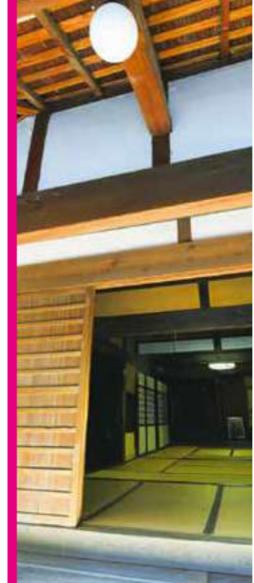
A dispensary room used from 1848 to around 1970 (usually not open to the public). Nagaya-Mon Gate also remains. They are Senju's treasures