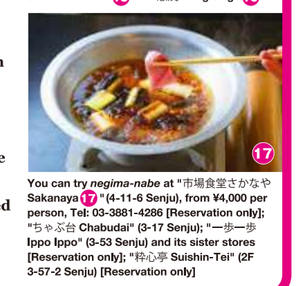
A morning auction where high-spirited voices echo starts at 6am in 山台青果市場 Yamagashiwa Market. Only Senju leeks have solid roots even after rinsing. You can buy Senju leeks in "足立市場: Adachi Wholesale Seafood Market (15)" or "葱茂: Negishige (16)" You can try negima-nabe at "市場食堂さかなや Sakanaya (17)" (4-11-6 Senju), from ¥4,000 per person, Tel: 03-3881-4286 [Reservation only]; "ちやぶ茶 Chabudaya" (9-17 Senju); "一歩一歩 Ippo Ippo" (3-53 Senju) and its sister stores [Reservation only]; "粋心亭 Sushin-Tei" (2F 3-57-2 Senju) [Reservation only]

Negima-nabe (Tuna and Leek Hot Pot), a dish for common people during the Edo period, is now quietly gaining momentum in Senju. After all, here is the town of "Senju leeks" that also has Tokyo's only wholesale market exclusively dedicated to Marine Products so called "Senju Riverside Fish Market". Thus, the members of "Senju Asunaro Group" decided that there was no choice but to start serving negima-nabe at events in the market and all around Senju. They opened their recipes to the public, and restaurants in Senju have gradually been adding it to their menu.