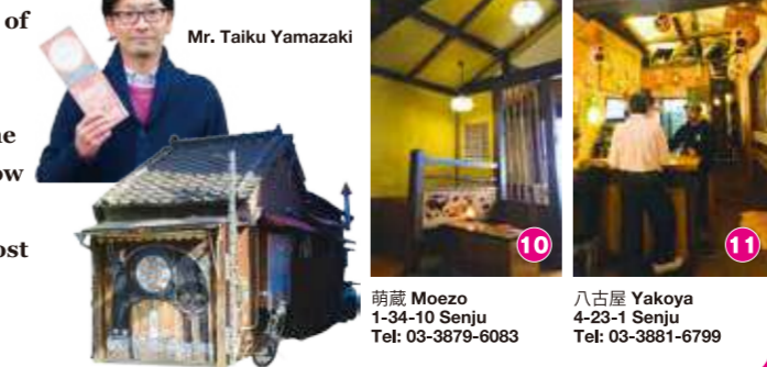
Mr. Taiku Yamazaki

The stories growing from the architecture in Senju are now so vibrant. Enjoy the townscape and make the most of your time by visiting Ikkenny (detached) shops.