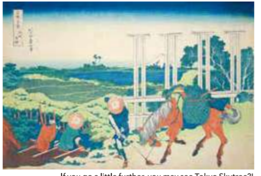
Who is flying...? If you go a little further, you may see Tokyo Skytree! Adachi Fireworks Festival is held here in summer!

There was an irrigation canal called "Motojukubori" through which water was drawn from Sumidagawa River. It is said that an ukiyo-e artist, Hokusai Katsushika (1760-1849), drew "Senju in Musashi Province" (one of "Thirty-six Views of Mt. Fuji") from the water gate of Motojukubori here. Let's compare the current landscape with his Ukiyo-e and think back to the Edo period.