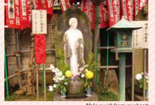
Used to have clearly marked features? Make a wish from your heart

As the name suggests, your wish is said to be fulfilled by clinking a Jizo (stone guardian deity) with a small stone and then praying. Due to this custom, the Jizo's appearance has changed since its creation in Genroku 12 (1699). We can feel the passing of time and the thoughts of people who have made wishes.