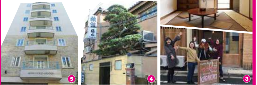
Hotel Coco Grand Kita-Senju 3-40-2 Senju, Tel: 03-3284-1195 From ¥8,200 per person per night (single room) / Relaxing hotel popular with business and leisure travellers 福水旅館 Fukusui Ryokan 3-52 Senju, Tel: 03-3881-4001 From ¥3,900 per person per night. / Clean, reasonably priced inn located near the station Guest house KAGARIBI 19-1 Senju-Yanagicho, Tel: 03-4291-2942 From ¥3,000 per person per night (dormitory) / 50-year-old house has been renovated into a Japanese style guest house

There are a number of inns in Senju. A quaint inn or modern hotel, which will you choose?