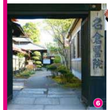
名倉医院 Nagura Clinic / 5-22-1 Senju, Tel: 03-3888-7711

Nagura clinic was famous for the unique and highly skilled bone-setting techniques, which even appeared in a Senryu (a comic haiku) in the Edo period. According to records, as many as 630 patients poured in per day in the Taisho period (1912–1926). Around the clinic, there were 5 inns with unique systems where the masters had a bone-setting license and patients were hospitalised and treated.