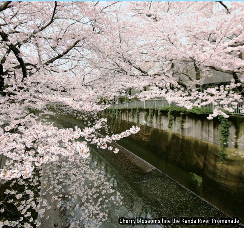
Cherry blossoms line the Kanda River Promenade

Shinjuku possesses a traditional dyeing culture. Take part in hands-on dyeing workshops!