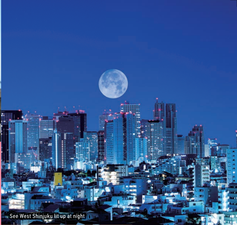
See West Shinjuku lit up at night