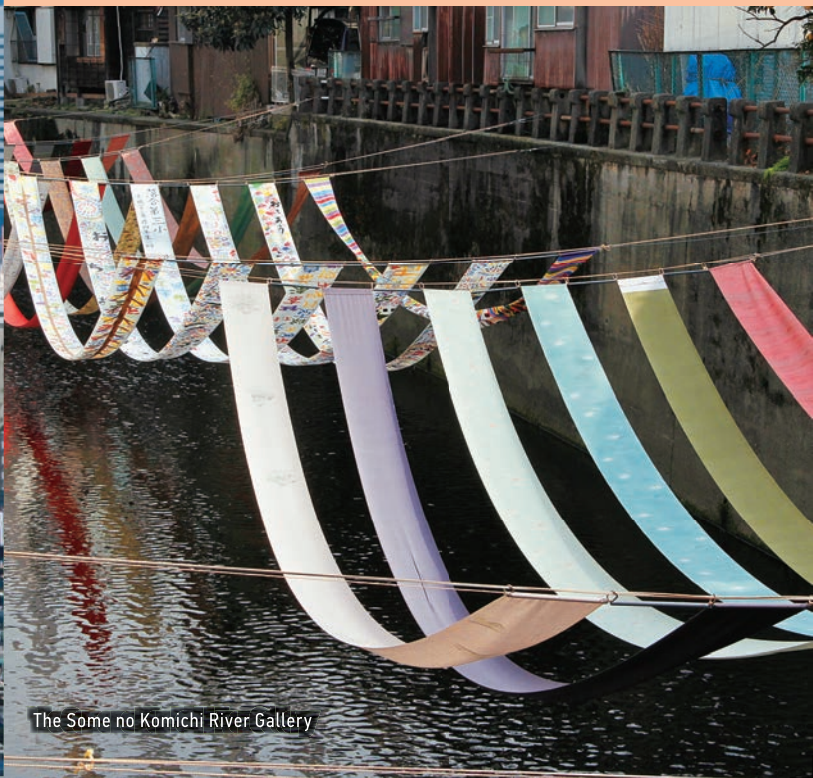
The Some no Komichi River Gallery