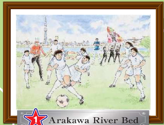
1 Arakawa River Bed

Fan must see Tsubasa appeared against the background of real Katsushika!!