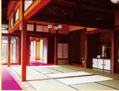
Kyotaku (Living room)

It features a hybrid Japanese-Western style, creating a splendid harmony by combining elements of a traditional shoin (Japanese drawing room) with Western architecture and a purely Japanese garden. The cultural value of Yamamoto-tei is appreciated overseas as well as in Japan.