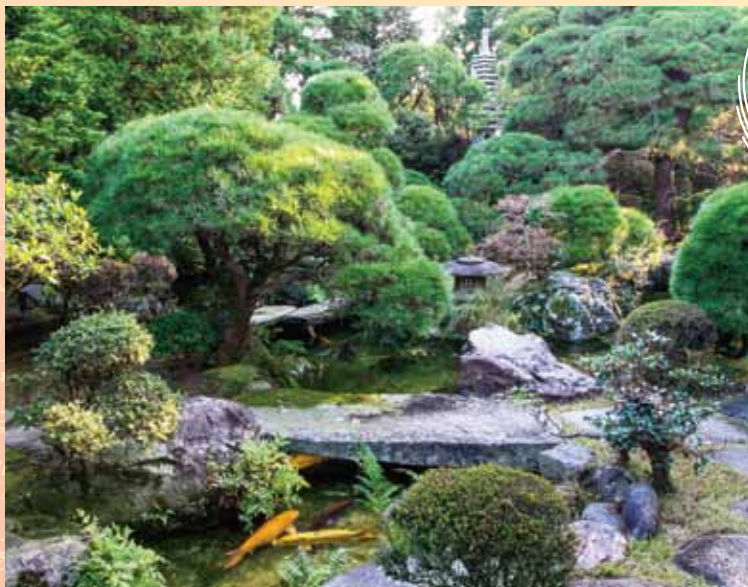
Shutei (Main garden)

In addition to the tall ceiling finished in white plaster and the floor with a mosaic design using wooden marquetry, the highlights are the marble mantelpiece and stained glass. Having the Western style room set adjacent to the entryway is a rather original style.