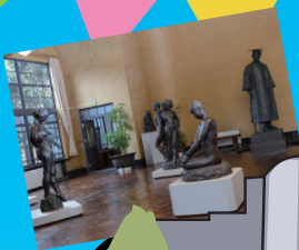
ASAKURA Museum of Sculpture