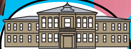
Sogakudo of the Former Tokyo Music School