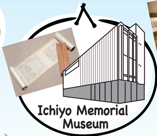
Ichiyo Memorial Museum