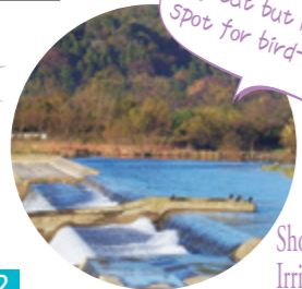
Showa Irrigation Dam A-4

Haijima Sta. Free Passage B-2 The south side of the passage offers amazing seasonal views, including Mt. Fuji and sunset.