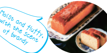
Moist and fluffy, with the scent of brandy

Kuzumochi Jelly Sweets Shop Chanoko F-4 ☎042-544-2421 9:30-18:30 (closed Sun.)