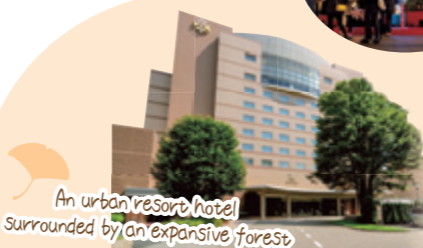
An urban resort hotel surrounded by an expansive forest

popular shops and entertainment, under one roof! Showa no Mori D-3 ☎042-546-0071 10:00-21:00 *Business hours differ for some shops