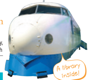
A library inside!

Bullet Train Library Akishima City Library, Tsutsujigaoka Branch ☎042-545-5448 12:30-17:00 (closed Mon.) E-3