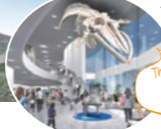
The life-size skeleton of Akishima Kujira greets visitors!

A new learning spot in Akishima, with library and regional archive! Akishima Educational Welfare General Center E-3 Scheduled to open in Mar. 2020