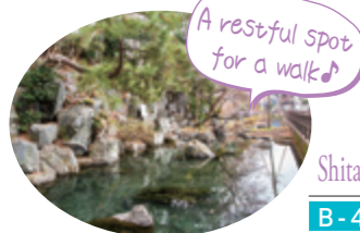
Shita no Kawa B-4