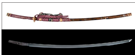
National treasure sword signed Nobuyoshi Collection of Japanese Sword Museum