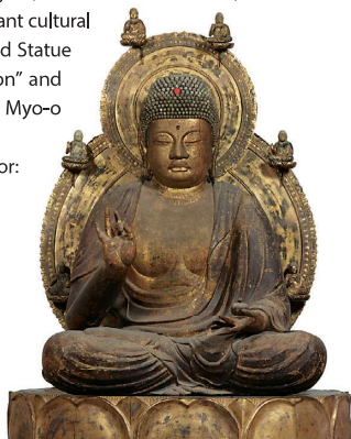
Yakushi Nyorai (Sk.Bhaiṣajyaguru) and attendant deities (National Treasure) Heian period, Daigoji.