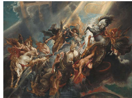
Peter Paul Rubens The Fall of Phaeton c.1604/05, Oil on canvas

🚶 Ueno Sta. (JR, Subway), Keisei Ueno Sta. (Keisei)